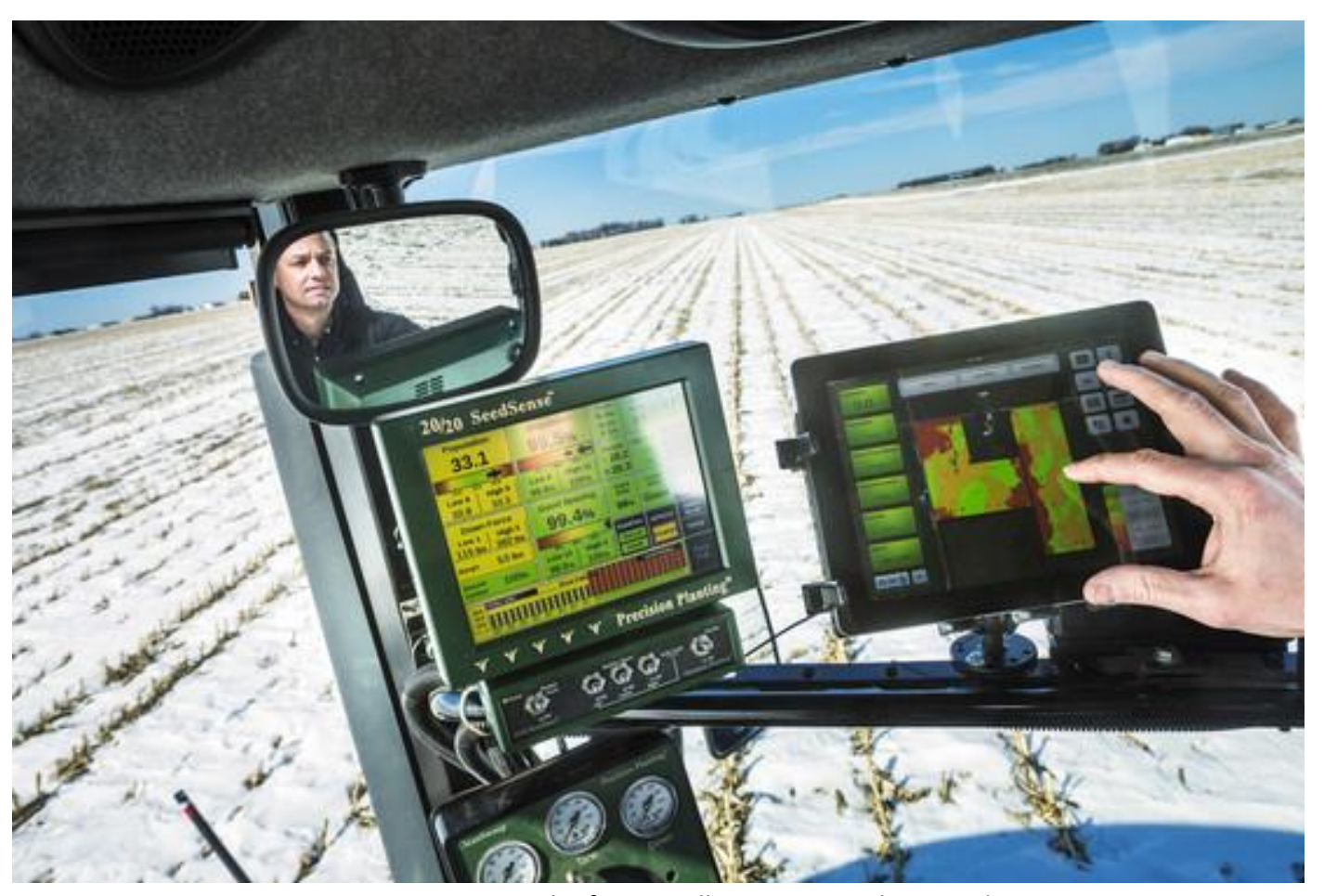
Bunge, Big Data on the farm, Wall Street Journal, 8 March 2014